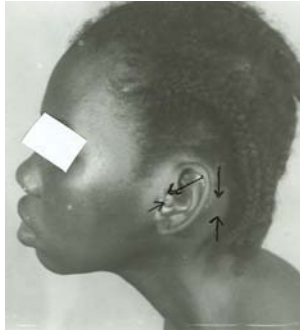
Figure 1a Left lateral view of the face showing fleshy soft tissue mass jutting out through the external auditory meatus and post-auricular swelling

Examination revealed a febrile and cachectic young lady with neck stiffness. There was a soft fleshy growth in the left EAC with mucopurulent secretion, and a left mastoid swelling which was firm but had some fluctuant areas (Figure 1a).