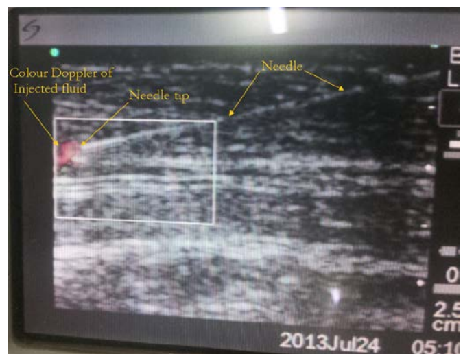
Figure 3: Colour flow Doppler image of needle.

Fig 2 is a 2D image showing the needle. Fig 3 is taken in the colour flow Doppler mode and it shows the colour flow image at the tip of the needle.