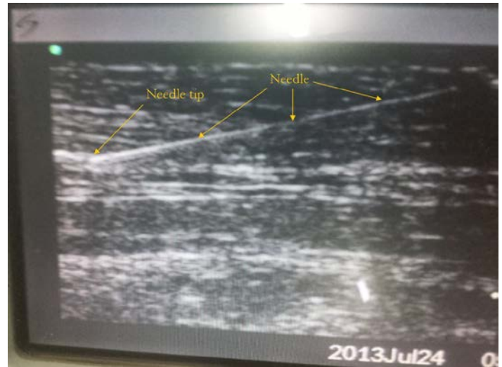
Figure 2: In-plane ultrasound image of needle.

It is therefore, necessary to employ other manoeuvres that will improve the ease of identification of the needle tip during insertion.